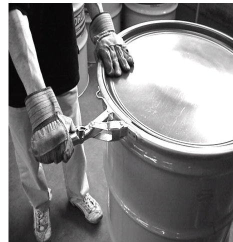
Figure 8 - Lever being closed slowly