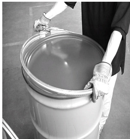
Figure 7 – Expanded ring being placed on drum